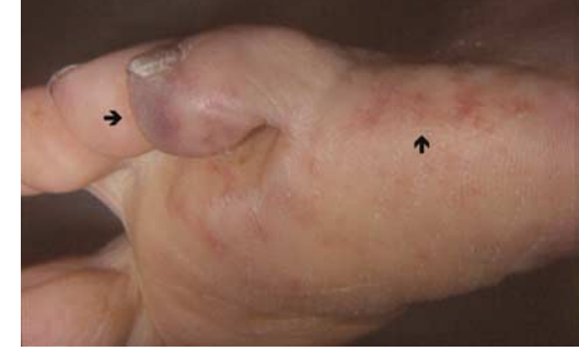
Figure 2 shows the source of atheroembolism. Cholesterol crystals are too small to close up the artery in which they